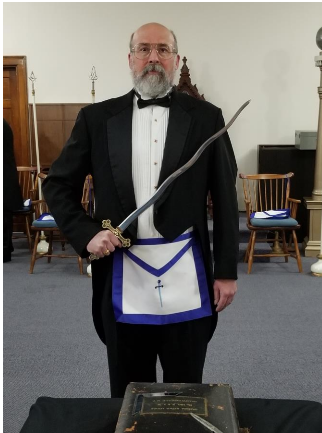
R.'.W.'. Stu Card with a Tyler's Sword, as shown above.